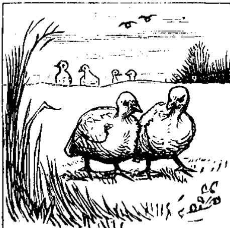
Partridges now pair.