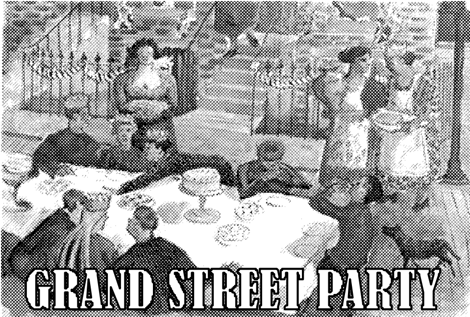
VE Day Street Party 1945 by Edwin LaDell

Well done everybody. Don't relax - we will be back.”