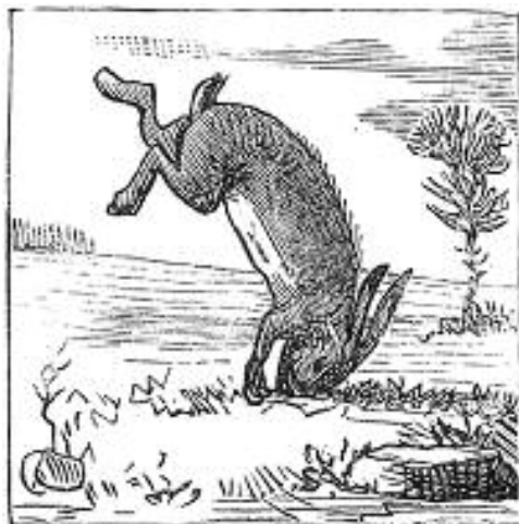
Hares are now mad.

* 1901 census. Published recently by The Public Records Office.