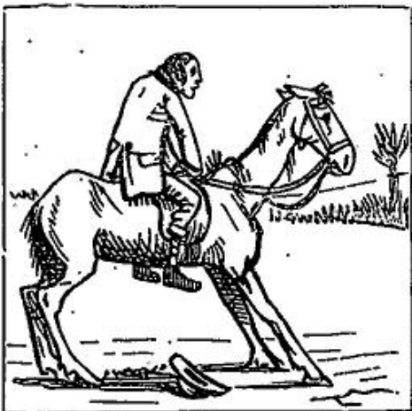
Fox-hunting still goes on. Or not...as the case may be.

Any additional donations may be sent via W J Wright, Funeral Directors, Well Lane, Stow-on-the-Wold GL54 1DG.