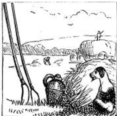
Haymaking slowly carried on.