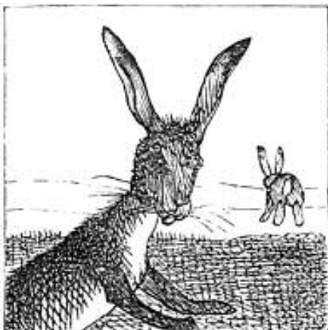
Hares are still mad.