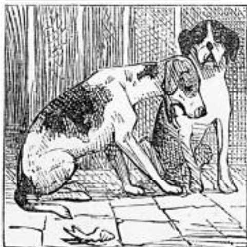
Fox-hounds are now idle.

Thanks due to Georgina for the continued arrival of our papers during February Snows. Her ingenuity knew no bounds. Some days dragging a sledge from Andoversford, delivering them on foot. Sometimes recruiting a 4 wheel driver to lessen the load. Brilliant!