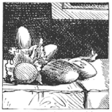
Auts are to be gathered in.

If there is enough interest sessions could be arranged in the village hall. If you are interested let Doris Austin know - 01242 820425