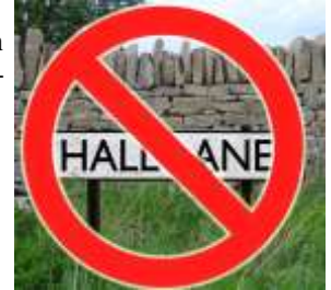
We don't want signs