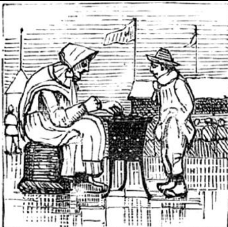
Fair on the Thames, 1814. (Feb 4th.)