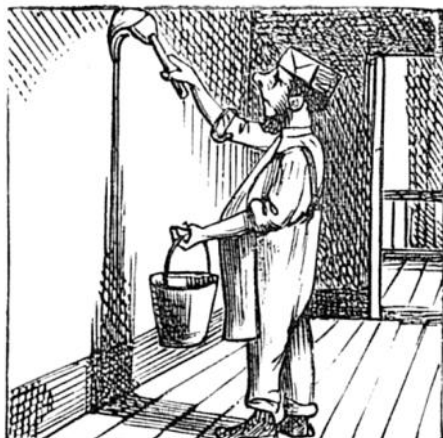
Common lodging-houses to be white-washed this week.