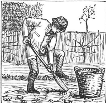
Gardens should now be carefully attended.