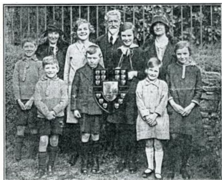
BROCKHAMPTON SUNDAY SCHOOL WINNERS

There will be a short question and answer session at the start of the meeting.